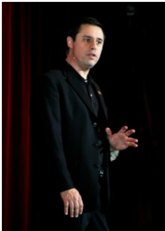
Four-time Olympian Ruben Gonzalez is one of the country's leading keynote speakers.

"You try to put that image away when it's your turn to race. You don't ever think something like that will happen. Before yesterday, I didn't think it even could happen. I've been in the sport for 27 years and I didn't think it was possible that someone could fly out of the